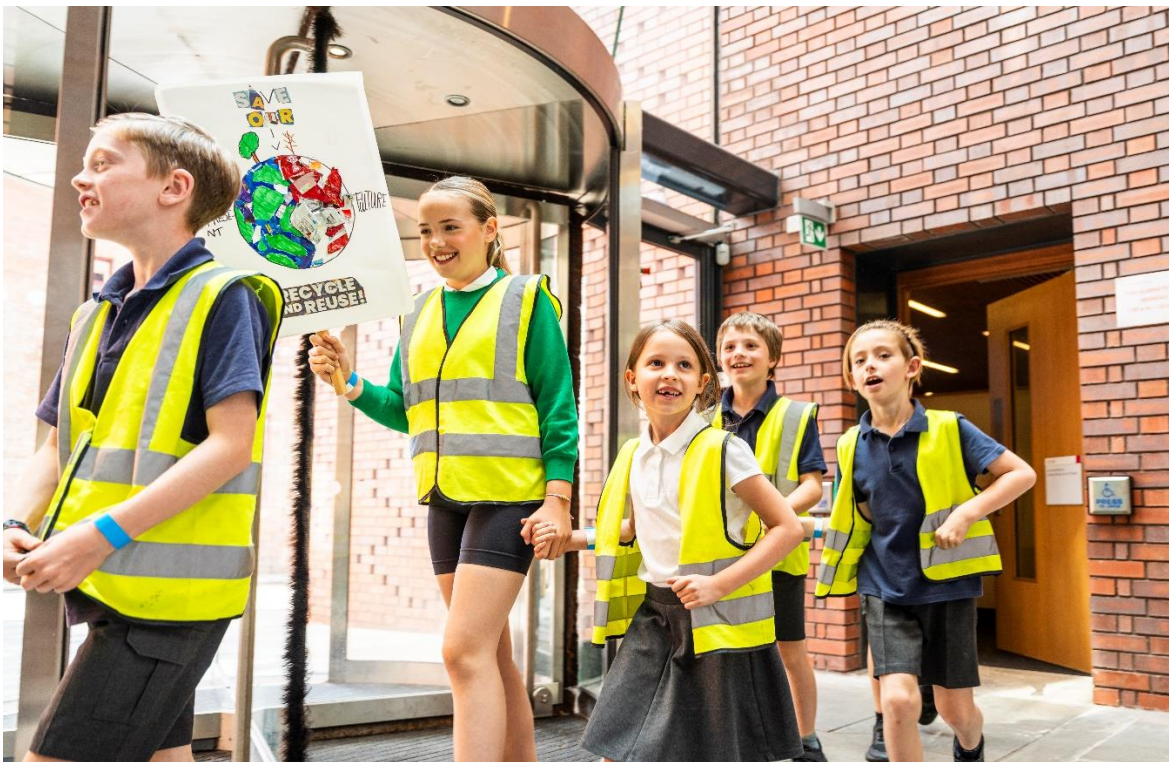
Students marching around Charles Street Building, Sheffield Hallam University

With only a few schools interviewed and the usual survey limits, these are best read as promising examples rather than firm, system-wide evidence. Even so, they show how the box can seed something bigger.