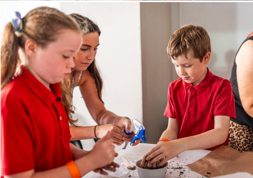
Students participating in Think Climate celebration activities