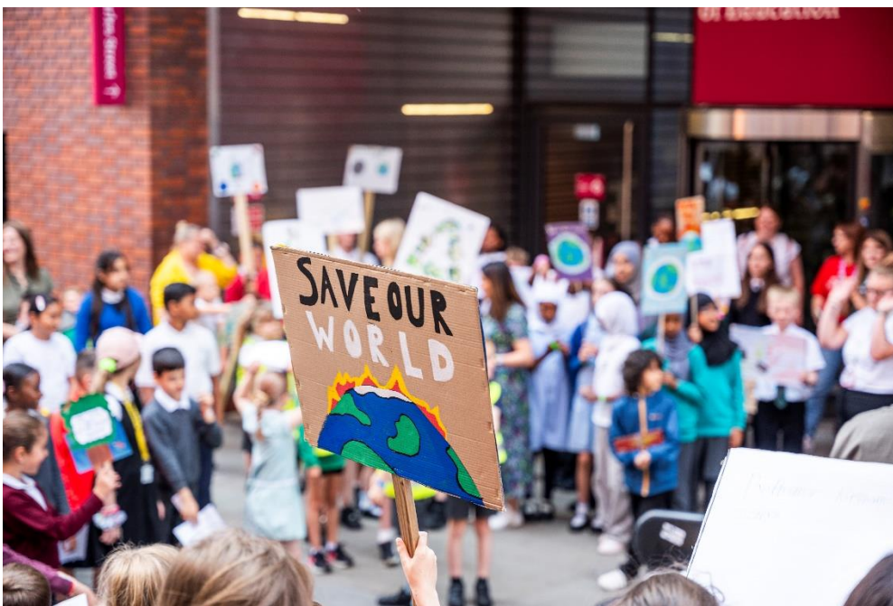
Climate march signs at the celebration event

This echoes what other school-based climate projects have found about the value of hands-on, exploratory learning.