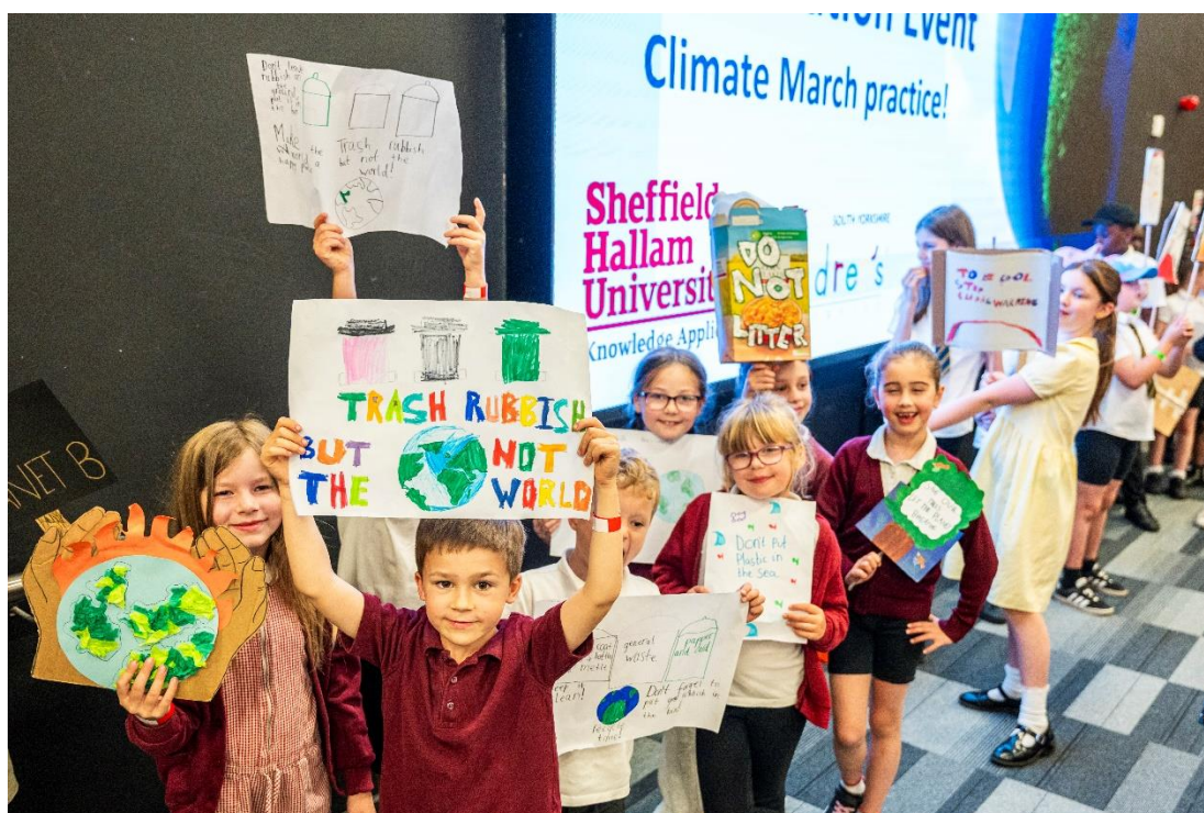
Students participate in the celebration event at Sheffield Hallam University

Eleven schools took part in the research, and these are listed in Appendix 2.