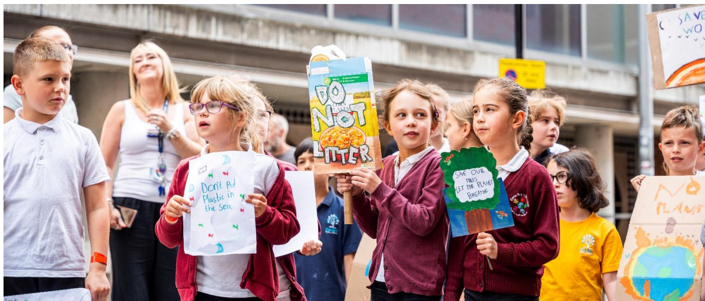
Students stood outside Charles Street Building undertaking a climate march

Above all, Project in a Box shows that good climate education does not depend on big budgets. It depends on creativity, accessibility and experiences that help children understand the world and believe they can shape it.