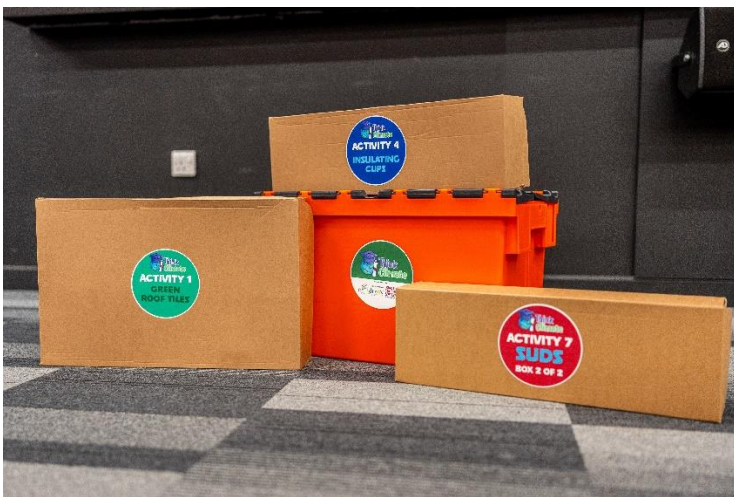
Project in a Box! Think Climate box at celebration event