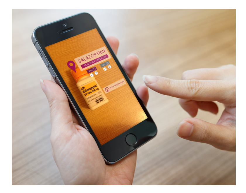
Figure 4: AR interaction with medication pack

From this round of secondary interviews a series of interfaces were developed. An example for participant C is shown in Fig 4.