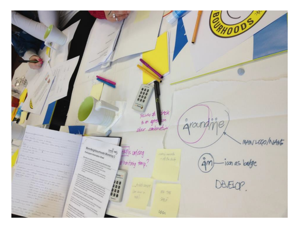
Figure 3: Simultaneous research and design stages, with users and stakeholders

held with potential users (older people, people with long-term health conditions, carers), commercial stakeholders (those working in the care industry), and technologists. 2D-illustrations were used to summarise service concepts in between the two cocreation sessions (see Figure 3 for example outputs), and existing sensor technology was used to rapidly prototype a working service which was implemented as a test pilot with 12 families. The inclusion of users in the process produced original and innovative ideas, e.g. commercial stakeholders had not considered environmental impact of the service, however users felt strongly that technology provided should be returnable and reused should a customer leave the service. Including commercial and technology stakeholders in the process allowed the development of a service which was acceptable to users, but also feasible. The service is now out for commercialisation (Holliday et al , 2014).