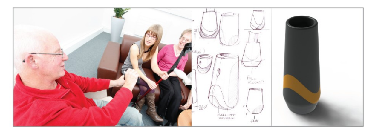
Figure 1: Development of the walking-stick ferrule