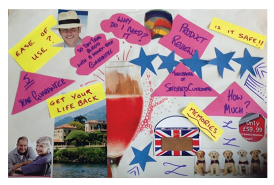
Figure 2: how YOP wish eAT were advertised

focus groups to explore YOP perceptions to eAT. The focus groups collected rich, saturated data which enabled the researchers to plan the second phase of research - exploring ideal consumer journeys when purchasing eAT. As this was considered service-design, it was felt that creative methodologies would be appropriate to explore the consumer journey - therefore a co-creative approach was utilised. The same participants took part in both phases of the research, which allowed the authors to gain a useful insight into participant perceptions of traditional versus creative methodologies. Although participants enjoyed taking part in the focus groups, despite the facilitator's skills there were some who felt unconfident about contributing, particularly in the presence of dominant group members. However, feedback from the cocreation sessions, suggested that all participants felt able to contribute, as the nature of the sessions relied on writing down thoughts or taking part in activities to produce data. Cocreation was particularly welcomed by participants whose first language was not English, and a participant who was hearing-impaired, as the asynchronous nature of the activities allowed people to take time to express their thoughts, rather than relying on verbal communication alone. The project results have been used to develop a range of consumer focused business-models, and advice for businesses regarding wants and needs of YOP (see Figure 2 for an example cocreation output).